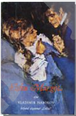
D14.is.1.1 First printing, 1970, cover, front

FIRST ICELANDIC TRANSLATION FIRST ICELANDIC EDITION ( JONS HELGANSONAR ) ¶ First printing, 1970