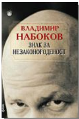
D24.bg.1.1 First printing, 2009, cover, front

FIRST BULGARIAN TRANSLATION FIRST BULGARIAN EDITION (FAMA)