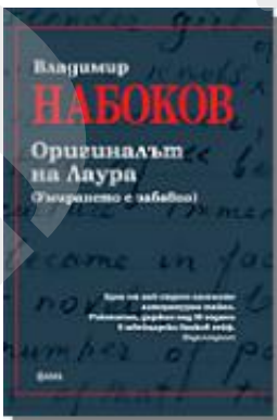
D68.bg.1.1 First printing, 2010, cover, front

FIRST BULGARIAN TRANSLATION FIRST BULGARIAN EDITION (FAMA)