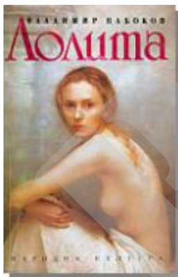
D28.bg.1.1 First printing, 1991, cover, front

FIRST BULGARIAN TRANSLATION FIRST BULGARIAN EDITION (NARODNA KULTURA)