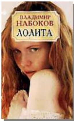
D28.bg.1.3 First printing, 2007, cover, front