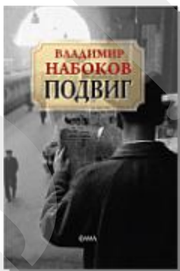
D13.bg.1.1 First printing, 2009, cover, front

FIRST BULGARIAN TRANSLATION FIRST BULGARIAN EDITION (FAMA) ¶ First printing, 2009