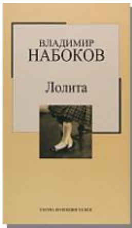
D28.bg.1.2 First printing, 2005, cover, front