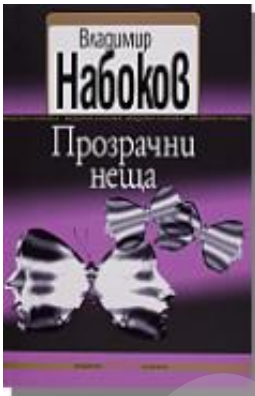
D42.bg.1.1 First printing, 2011, cover, front

FIRST BULGARIAN TRANSLATION FIRST BULGARIAN EDITION (COLIBRI)