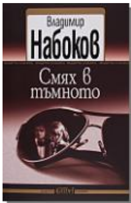
D14.bg.1.1 First printing, 2012, cover, front

Смях в тъмното [ Smiakh v tãmnoto / Laughter in the dark ]. Translated by an unknown translator. Sofia: Colibri, 2012.