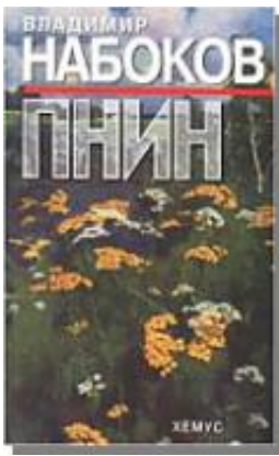
D30.bg.1.1 First printing, 2000, cover, front

In wrappers with photo of field of wildflowers. ISBN: 954-428-203-3.