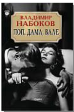
D9.bg.1.1 First printing, 2008, cover, front

FIRST BULGARIAN TRANSLATION FIRST BULGARIAN EDITION (FAMA) ¶ First printing, 2008