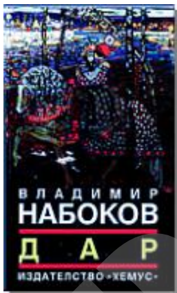
D17.bg.1.1 First printing, 1997, cover, front