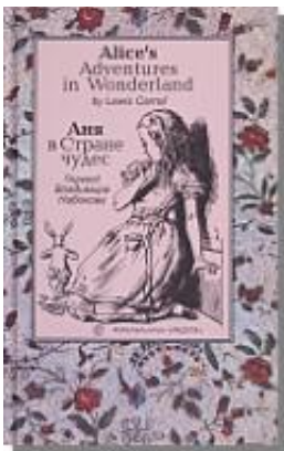
A7.9 Third printing, 2000, cover, front

| by Lewis Carroll | \device\ | Аня | в стране чудес | Перевод | Владимира | Набокова \end of ruled box\ | \publisher's device\ | Москва | ОАО Издательство «РАДУГА» | 2000