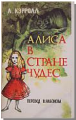
A7.8 First printing, 1991, cover, front