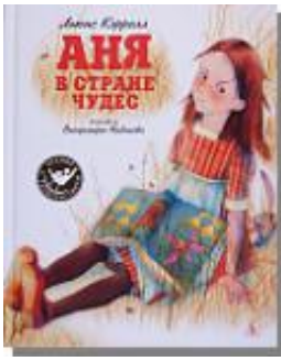
A7.16 First printing, 2011, cover, front

Description: Color illustrations by Elena Selivanova. This is a heavily illustrated book aimed at the children's market.