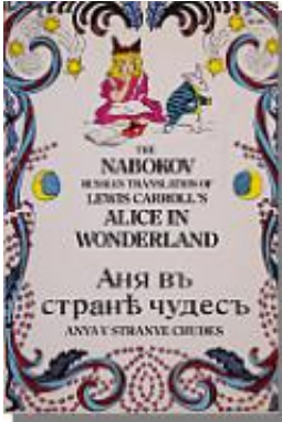
A7.2 First printing, 1976, cover, front

Collation: (20.4 X 13.6 cm), [1-4] 16 , 64 leaves, pp. [i-vi] [1] 2 [3-4] 5-114 [115-122]