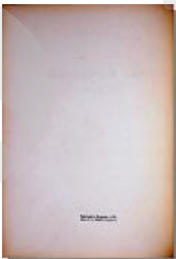
A7.1 First printing, variant a, 1923, copyright page

Collation: (22.2 X 15 cm), [1] 8 2–7 8 8 2 , 58 leaves, pp. [1–4] 5–114 [115–116]