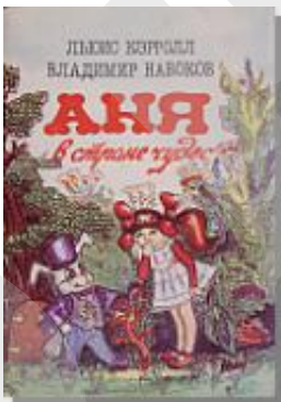
A7.6 First printing, 1991, cover, front