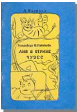
A7.7 First printing, 1991, cover, front

Title page: Л. Керролл | АНЯ В СТРАНЕ | ЧУДЕС | В переводе В. Набокова | Издание народного предприятия | ПАЛЕСТРА® \publisher's device\ | Ленинград 1991