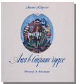
A7.4 First printing, 1989, cover, front