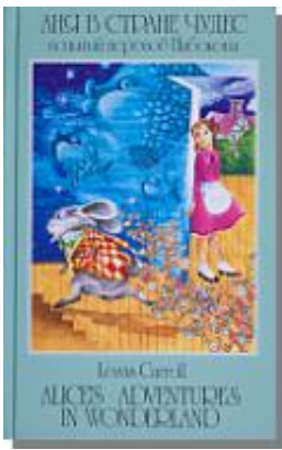
A7.12 First printing, 2004, cover, front

Press run: 5000 copies according to the colophon