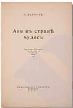
A7.1 First printing, variant a, 1923, title page