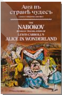
A7.2 New printing, 1981, cover, front

Binding: White wrappers. Front cover: \colored version of a Tenniel drawing\ \white\ Аня въ | странѣ чудесѣ | (ANYA V STRANYE CHUDES) | \fancy rule\ | THE | NABOKOV | RUSSIAN TRANSLATION OF | LEWIS CARROLL'S | ALICE IN WONDERLAND. Back cover: \at bottom\ ISBN 0-486-23316-2 $3.00 in U.S.A.