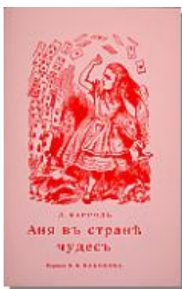
A7.3 First printing, issue a, 1982, cover, front

Issue a is bound in wrappers, issue b in cloth-covered boards.