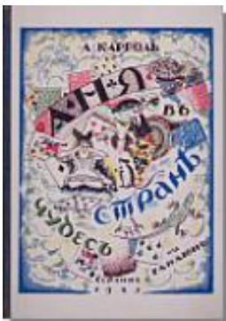
A7.1 First printing, variant a, 1923, cover, front

Both variants have the same paper covering. But variant a is bound in boards; variant b is in wrappers.