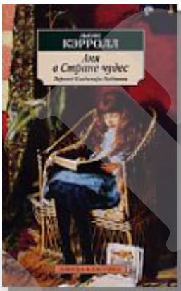
A7.15 First printing, 2010, cover, front

1) Аня в стране чудес [Ania v strane chudes / Anna in wonderland]