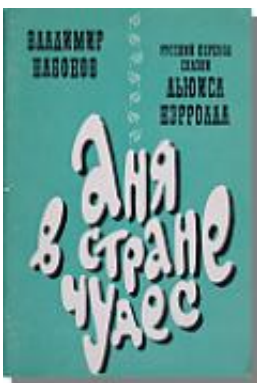
A7.5 First printing, 1991, cover, front