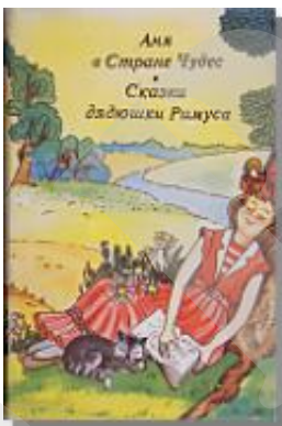
A7.11 First printing, 1993, cover, front

1) Аня в стране чудес [Ania v strane chudes / Anna in wonderland]